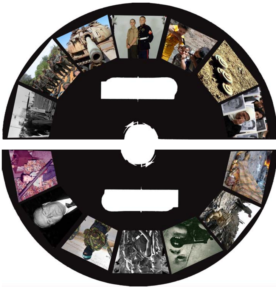
nasty world -negativo circolare- 2009