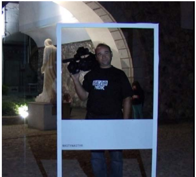
Portable Portrait Set -still da video- Skopje 2010