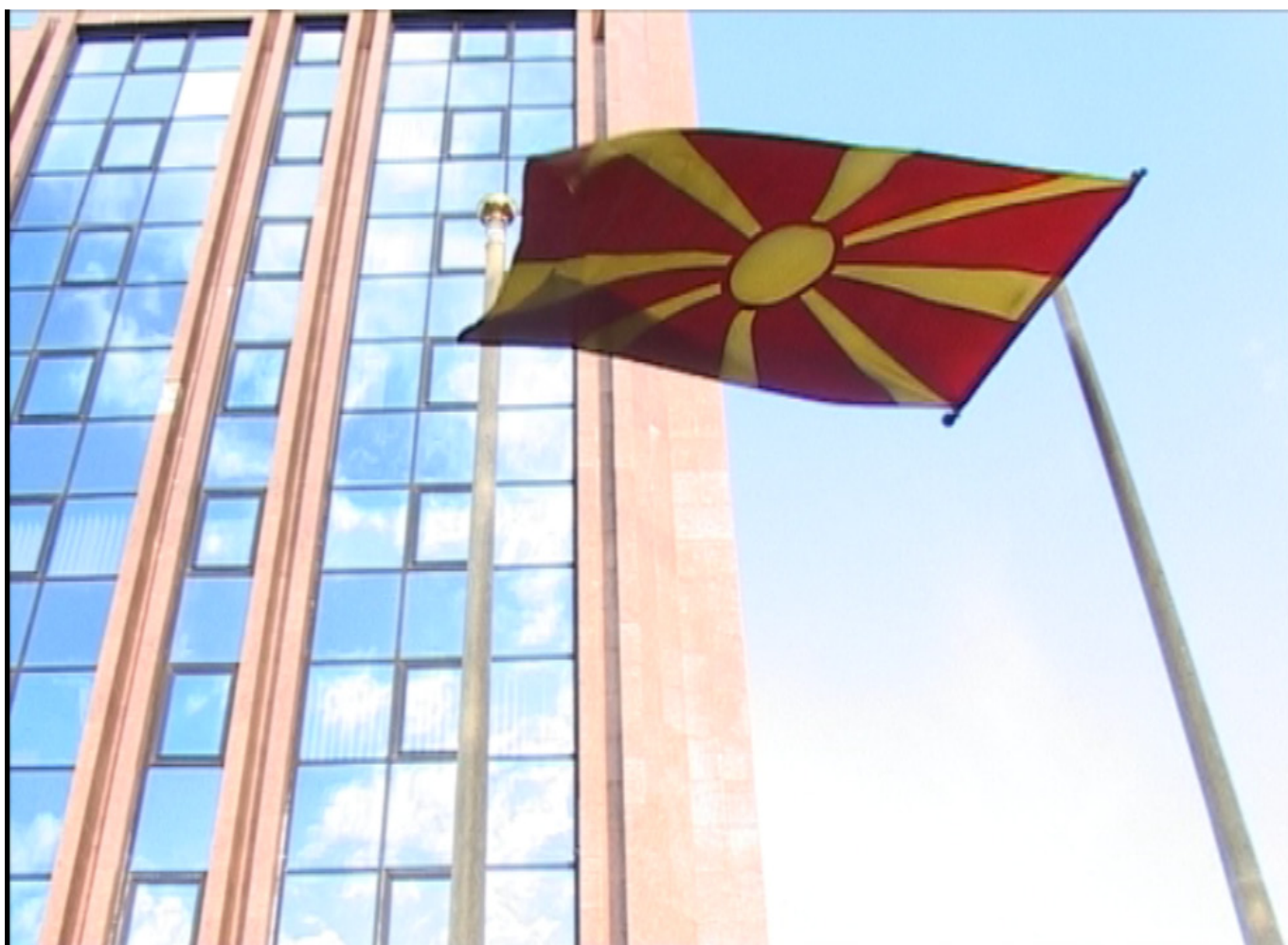
mk -still da video- Skopje 2010