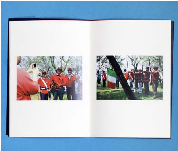
blisterZine #2 -R.I.P.- 2010