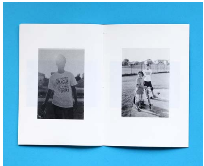
blisterZine #3 -suburban/R.G.B.- 2010