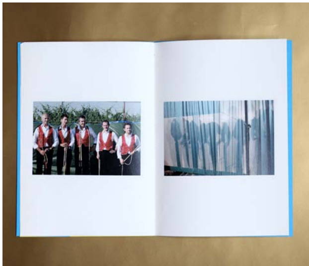
blisterZine #4 -Ifolk U- 2010