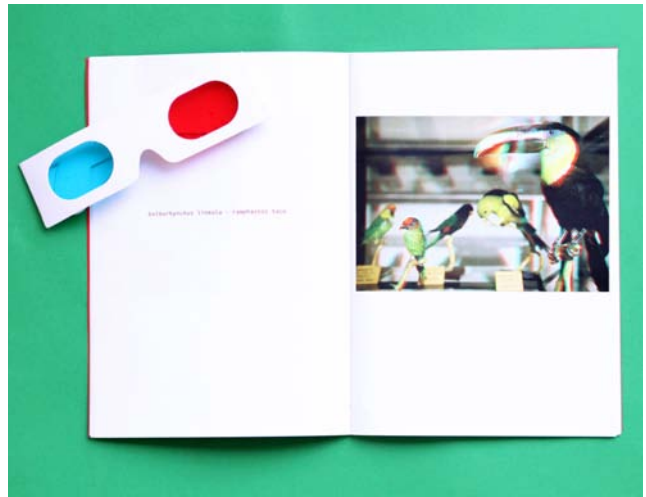
blisterZine #5 -salt marsh predators- 2010