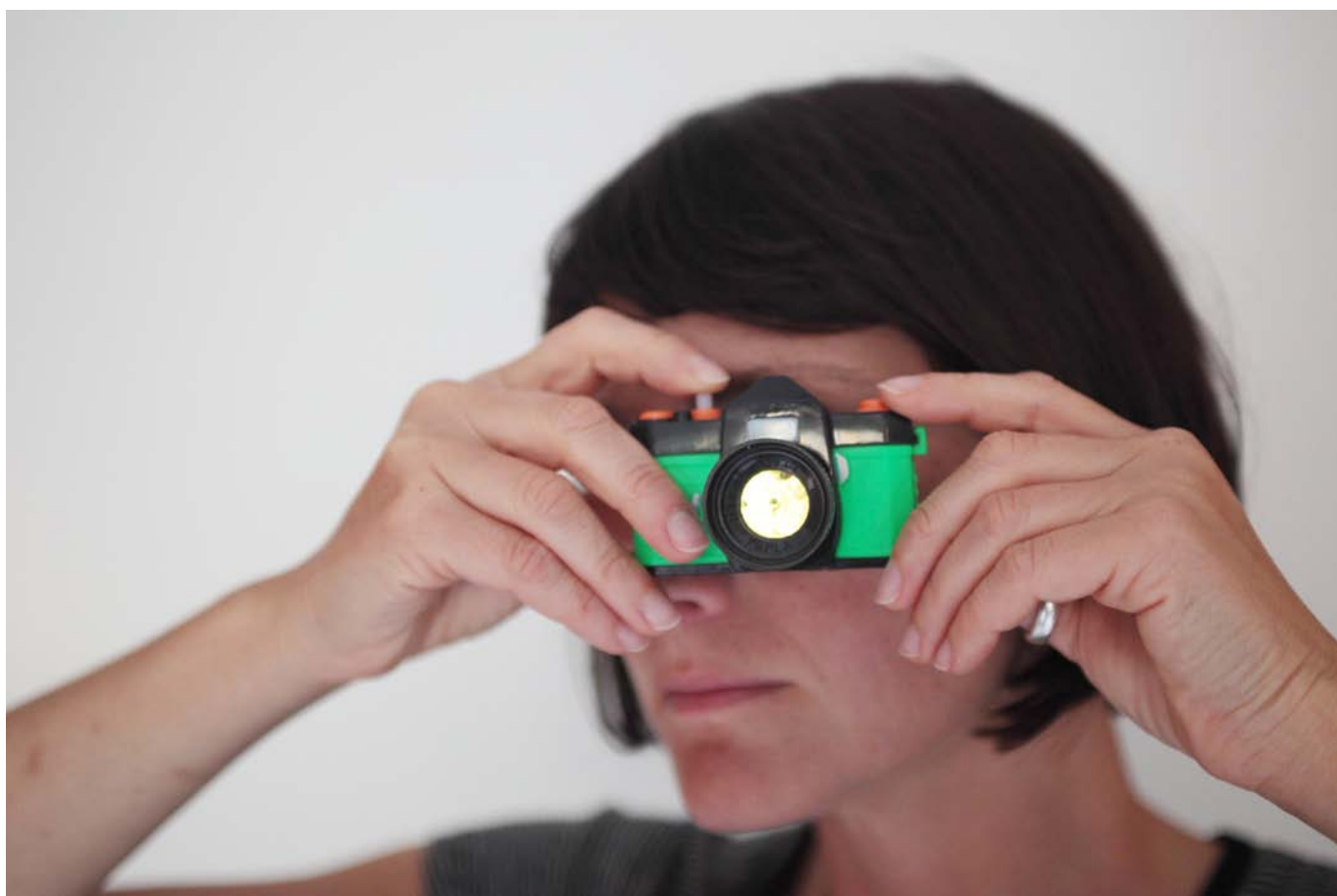
nasty world -toy mini camera- 2009