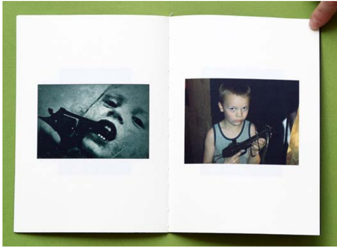
blisterZine #1 -we need a war- 2009